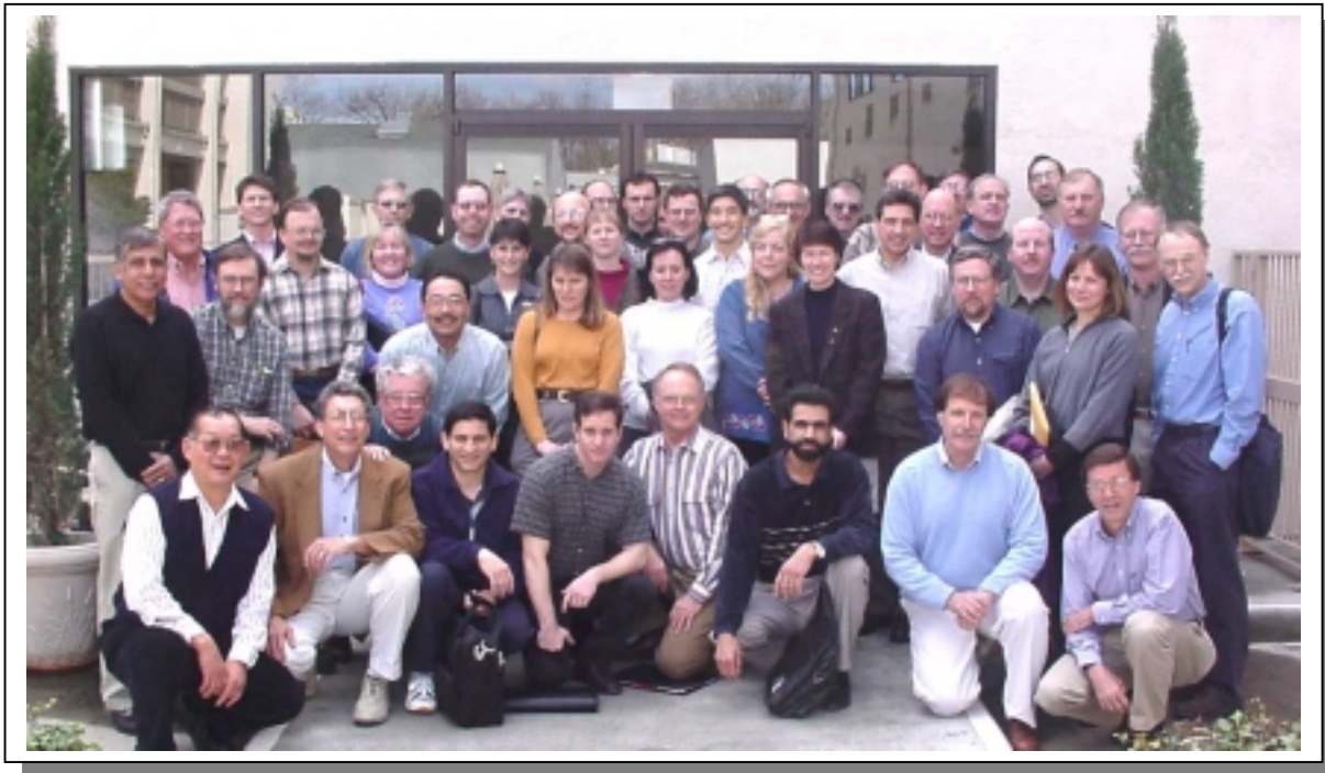
Attendees at the Southern Regional Project S-301, "Development, evaluation and safety of entomopathogens for control of arthropod pests", February 25-26, 2001.

To ensure that your membership remains current and that you continue receiving the Newsletter, please return your dues notice with payment or access the web site for online dues payment. Please contact the SIP Executive Secretary if you have questions or need information about payment. (See Page 2 for addresses.)